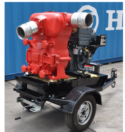
Trailer mounted option

Due to our program of continuous product development the manufacturer reserves the right to alter specifications without notice.